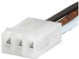
Wire Harness Wire harness for SCHURTER products