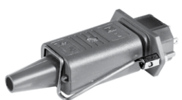
Cord retaining kits Cord retaining strain relief